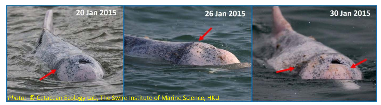
Increasing number of skin lesions on Hope's head

Continuous deterioration of the wound at the base of the fluke in the past two weeks