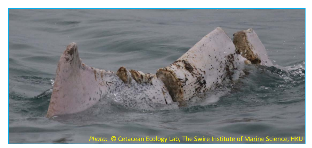
Hope photographed off SW Lantau on 30-Jan-2015

While Hope's body tries to fight off infection and cope with its severe injuries, its nutritional demands are obviously greater than under normal circumstances. However, his movement is seriously impaired by the severe injuries and so its nutritional intake is evidently compromised. Putting it in simple terms, the animal is starving, and this only hardens its overall struggle for survival.